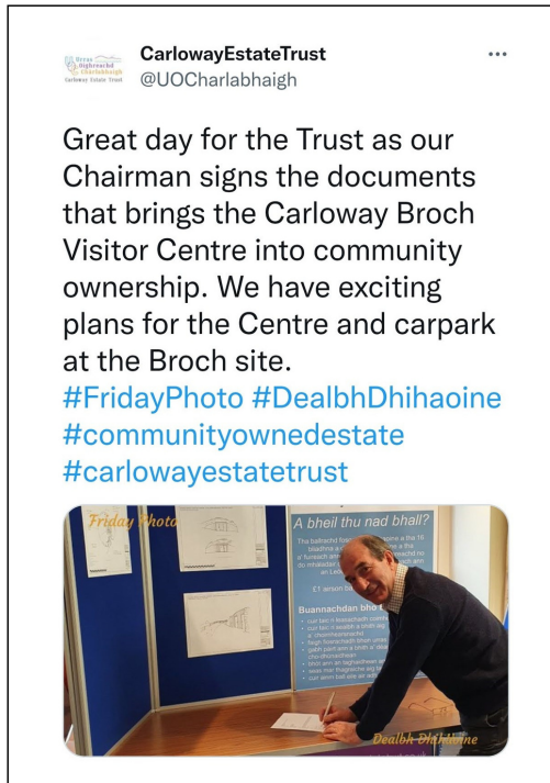
Our most popular tweet of 2022!

We are delighted to share that Urras Oighreachd Chàrlabaigh purchased the Doune Broch Visitor Centre and car park in March 2022. This was supported by funding from a Stage 2 Scottish Land Fund grant, The funding included capital funding to purchase the building, support with legal costs and insurance. It also supports staff time to oversee the development and funding for a design team, including an interpretation specialist, to produce designs to RIBA Stage 2.